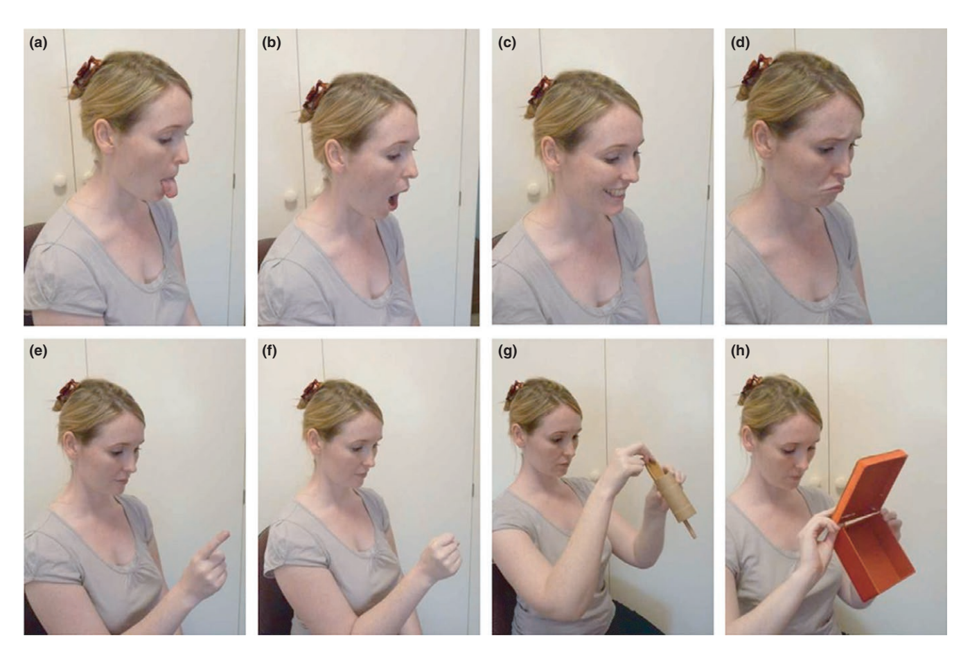
FIGURE 1 The face is a salient visual stimulus to young infants. In Oostenbroek et al.'s procedure, the adult's face was directly behind the finger movements (panels e and f), which may distract infants and dampen manual imitation.

Fourth, the response criteria used to assess imitation were poorly justified in several cases. For example, the imitation of a manual gesture was only counted if the infant imitated at "midline" and not when