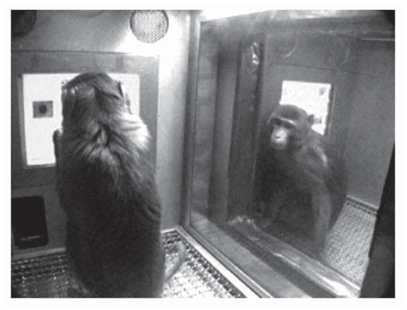
Fig. 3 - Cognitive Imitation Paradigm. During an 'Observation' phase, a 'student' monkey (right) was given the opportunity to learn the order of novel picture items from he 'expert' monkey (left) immediately before being tested on the order of those same items.

In all three conditions, computer feedback was available to students. However, in the social-learning condition (Experiment 1) the student could have learned the ordinal position of individual picture items from computer feedback alone, rather than from the actions of the model. To test whether performance in the social-learning condition could be replicated by providing naïve students with computer feedback only, in Experiment 3 all features of the social-learning condition were maintained, except that during the computer feedback condition no monkey was present in the adjacent chamber and the computer automatically highlighted the target items in the correct serial order. This control condition is often referred to in the literature as the 'Ghost Control.' After 20 trials, the student was tested on the same list. As was done in the previous experiments,